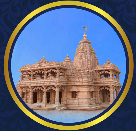
KIRTI MANDIR BARSANA

Amongst the many unique and beautiful temples in India, stands three magnificent temples that have been inspired and built through the will and inspiration of Jagadguru Shri Kripalu Ji Maharaj. There are many reasons behind the building of a temple, but one of the core reasons is to have a physical monument that reminds us of the existence and love of God and His Saints. As soon as you walk into any of these wondrous temples, Bhakti Mandir (in Bhakti Dham, Mangarh), Prem Mandir (in Vrindavan) or Kirti Mandir (in Barsana), you will be in awe of the stunning beauty of God. Each temple has similar elements built in them, including writings that are embedded within the walls so that one can learn the essence of the Vedas and its teachings. Everything you see brings you closer to the Divine. Jagadguru Kripalu Parishat invites everyone to these amazing Monuments of Love .