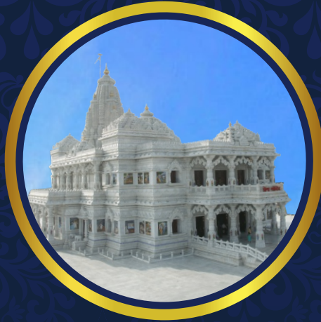
PREM MANDIR VRINDAVAN