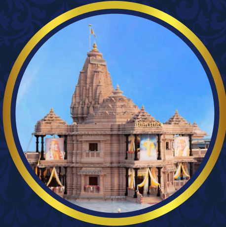
BHAKTI MANDIR MANGARH